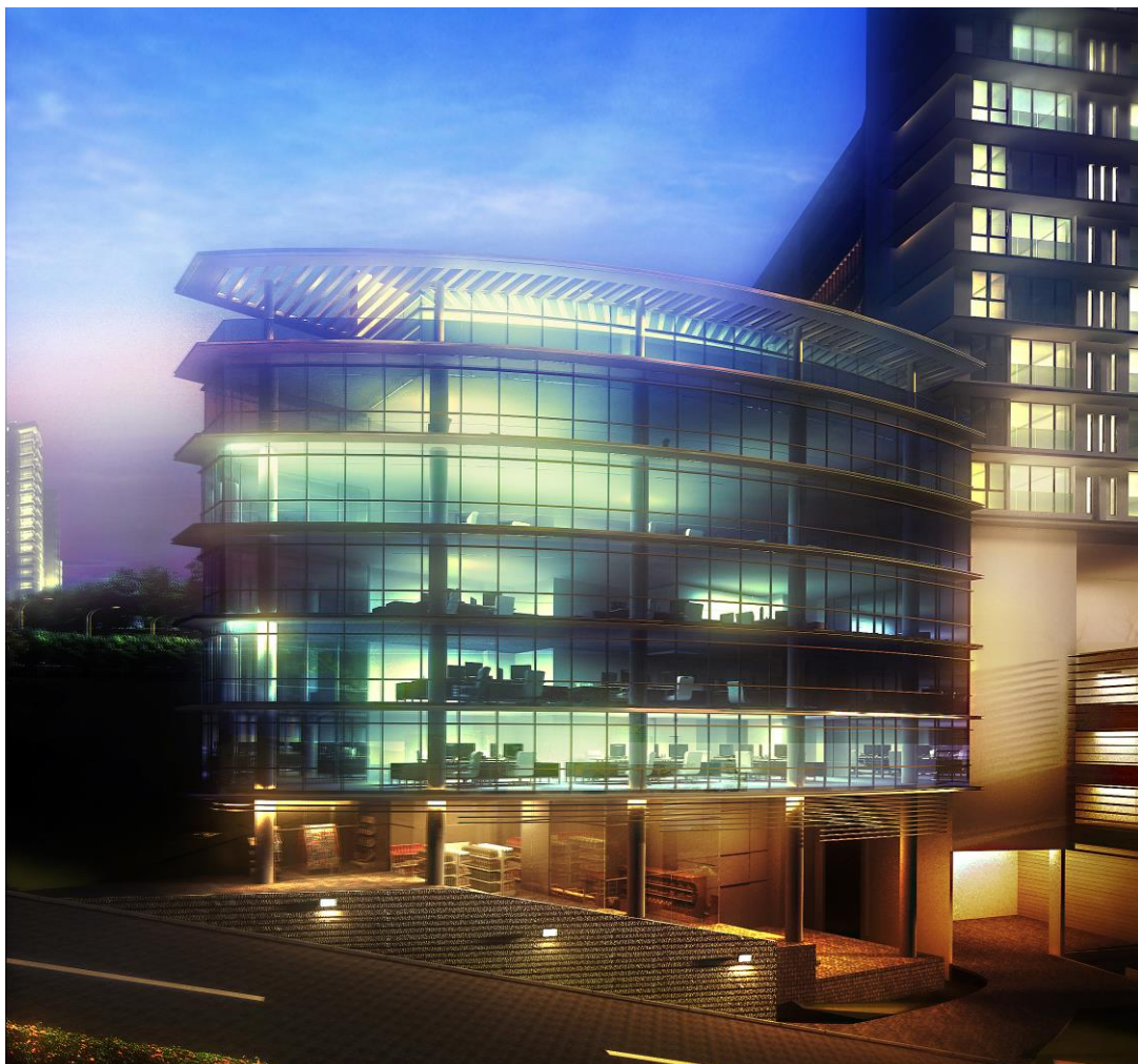
Avara Apartments-Port Moresby, PNG

Kramer Ausenco conducts its affairs in accordance with a set of operating procedures referred to as the Kramer Ausenco Business System. This system has been third party certified to conform to the requirements of AS/NZS ISO 9001.