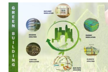
Figure 12 Flow Chart - Green Building Management System