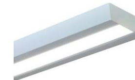
Figure 11 Lighting Efficient Dynamic Fixture