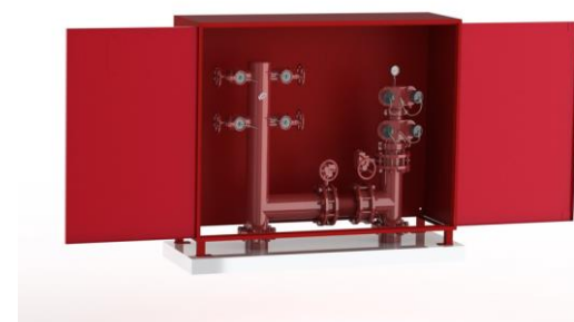
Figure 9 Fire Brigade Booster