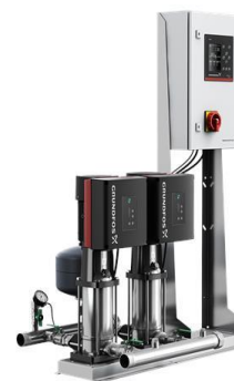
Figure 8 Energy Efficient Water Pumps