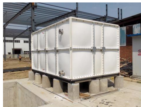
Figure 7 Braithwaite Pressed Steel Tanks