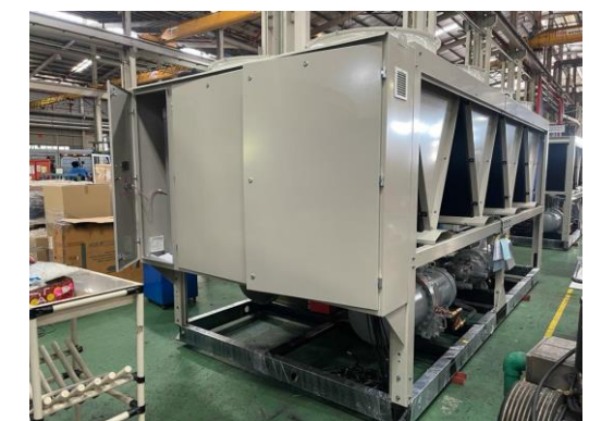
Figure 3 Project ACCH Chillers in Manufacturing Facility