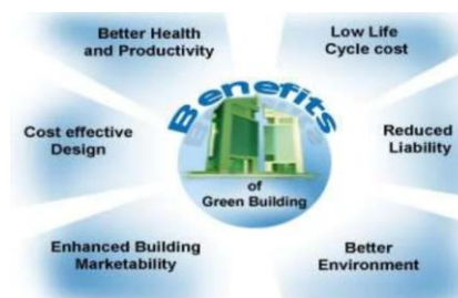
Figure 1 - Green Building Initiatives