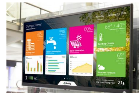
Figure 2 Monitor displaying the buildings energy and water usage

All power and water meters are linked to the Building Management System (BMS) for ease of monitoring and collection of data. The BMS is used to provide a means to centrally monitor energy and also control the designated equipment installed on the site. Training and full documentation of the BMS interface is provided as part of the commissioning of this building. In addition, there are separate meters per tenant area per floor that allows tenants to monitor their lighting, power and air conditioning energy use separately. The building will be an education tool promoting energy efficiency and water savings. Monitors will be provided in the foyer displaying the buildings energy and water usage.